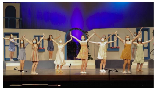
The Dance Ensemble dances to "Mamma Mia" as their big finale.