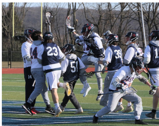
A group of players jumps in the air to get the ball.