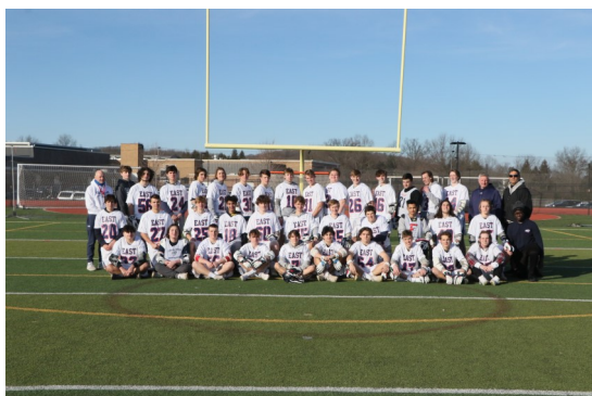
Boys' Varsity Lacrosse team picture.